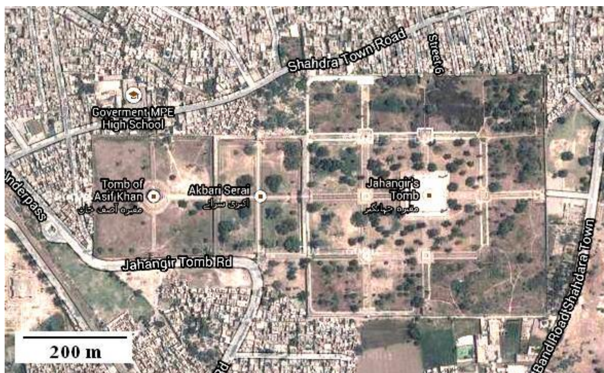
Figure 1 - The Jahangir's Tomb is located near the town of Shahdara Bagh in Lahore, Pakistan. The mausoleum is at the centre of a walled garden, the Dilkusha Charbagh.