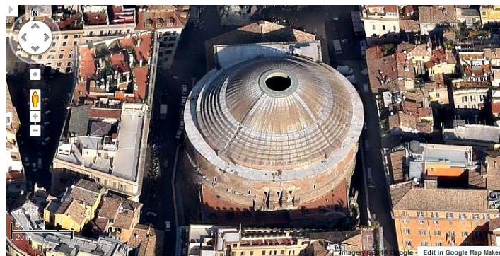
Figure 1 – The coffered concrete dome of the Pantheon in Rome, with a central opening (oculus) to the sky, as seen from satellite.

As previously told, concrete is prepared by the hardening of cement and aggregate. The aggregate could be made of pebbles, ceramic tiles and brick rubbles obtained from the demolition of buildings. The cement is a binder or mortar, which is a substance that sets when mixed with water and then hardens binding together the particles of aggregate. From the third century BC, the ancient Romans were able to prepare high-quality hydraulic cement, suitable for building harbors, because they made it of lime and pozzolana, the volcanic dust of Puteoli [6]. This mixture of pozzolana with the lime produced by heating limestone was called “caementum”. “Opus caementicium” was the Roman concrete. Let us note that the Roman caementum has much in common with its modern counterpart, the Portland cement: that is, its composition is very close to that of modern cement [6].