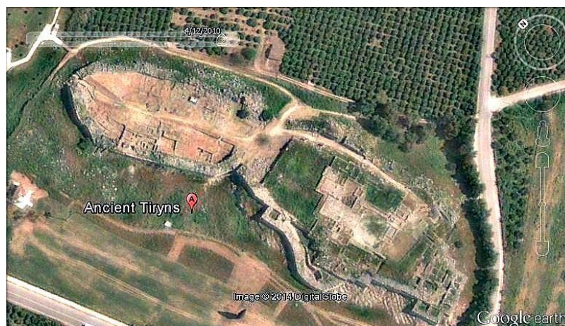
Figure 3 - Google Earth view of Tiryns.