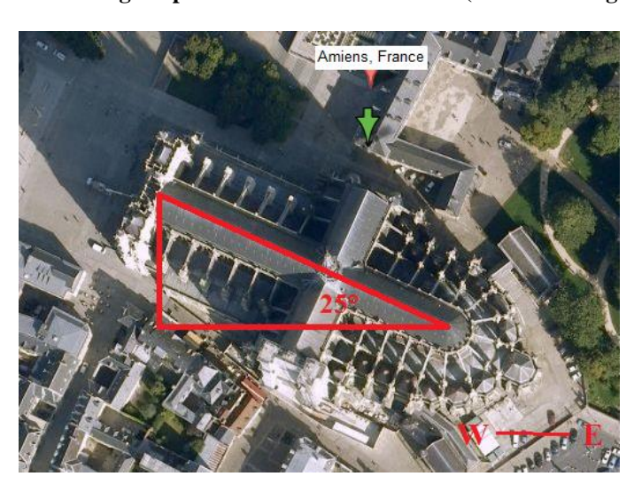
Figure 3 - The West-East direction is giving the reference axis. Angles are positive or negative when they are counterclockwise or clockwise. In the case of the Amiens cathedral the angle is of 25 degrees negative.