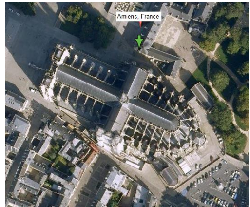
Figure 2 - Radiating chapels of the Amiens cathedral (from the Google Maps).