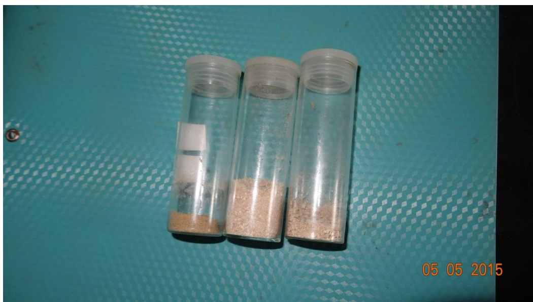
Figure 2: Refined powder of M. decumbens obtained through evaporation

M. decumbens was confirmed to have the capacity to coagulate suspended dirty in water hence making it clean enough to wash clothes and for other domestic uses (Figure 3).