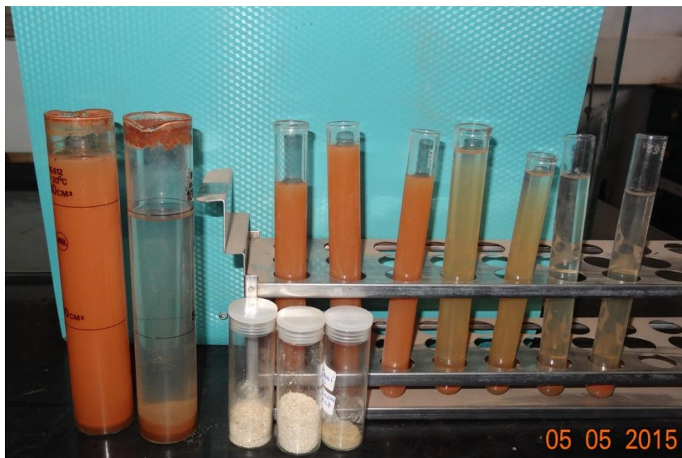
Figure3: Dirty surface run off water cleaned using refined Maerua powder

However, the community members interviewed indicated that the status of use of M. decumbens root for water purification was going down with emergence of artificial water coagulants such as Alum and other artificial water purifiers used in form of tablets and liquids.